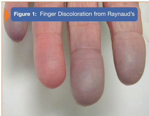
Figure 1: Finger Discoloration from Raynaud's

Raynaud's phenomenon (temporary spasm of the arteries in the fingers, resulting in coolness and bluish/purple discoloration – see Figure 1 ) may occur with rheumatoid arthritis, systemic lupus, and scleroderma, to name a few. If the condition is more severe, fingertip ulcers may result from the poor circulation.