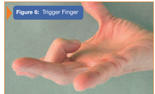
Figure 6: Trigger Finger

Diseases of the hormones (endocrine system), may result in changes of tendon and ligament tissue. Diabetes is a known cause of "trigger finger" ( see Figure 6 ), in which the finger may be temporarily locked in the flexed position, often with pain.