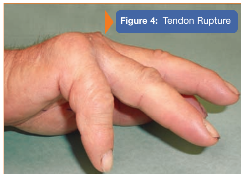
Figure 4: Tendon Rupture

Rheumatoid arthritis causes destruction of joints, ligaments and tendons. It can have widespread effects throughout the body. Tendon rupture ( see Figure 4 ) may result in limited ability to straighten a finger(s), and may be one of the first signs of rheumatoid arthritis.